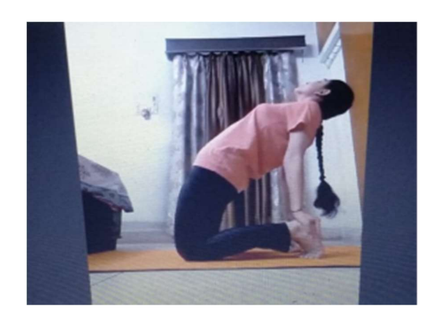
One of the participants of this Yoga Workshop (May 24, 2021)