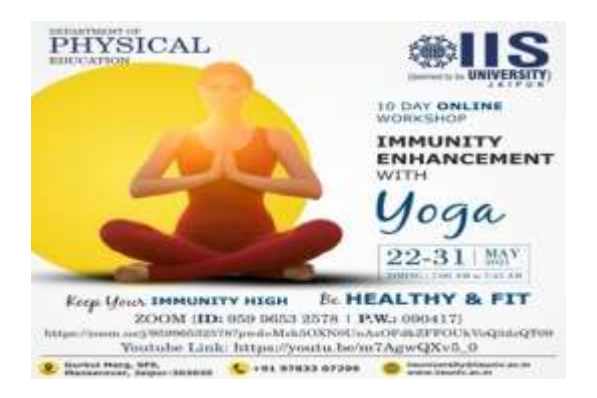
Brochure of the 10 Days Online Yoga Workshop (May 22, 2021 - May 31, 2021)